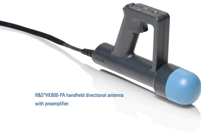
R&S®HE800-PA handheld directional antenna with preamplifier.

The R&S®HE800-PA handheld directional antenna with preamplifier together with an analyzer or receiver allows precise detection and location of transmitters and interference sources in the very wide frequency range from 18 GHz to 44 GHz.