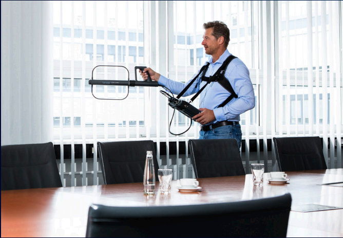
General interference hunting.