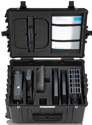
R&S®HE400Z1 transport case.