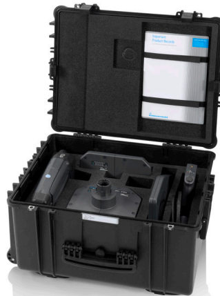
R&S®HE400Z5 transport case suitable for R&S®HE400SHF/HE400SCB.