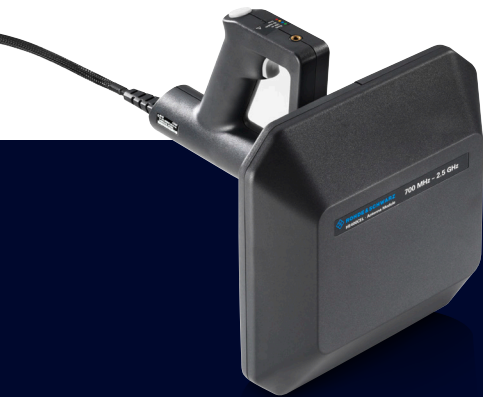
R&S®HE400MW microwave handheld directional antenna with R&S®HE400CEL.