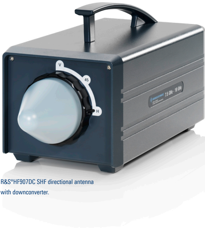
R&S®HF907DC SHF directional antenna with downconverter.

The R&S®HF907DC SHF directional antenna with downconverter together with a receiver can detect and locate transmitters and interference sources from 7.5 GHz to 18 GHz with high accuracy.