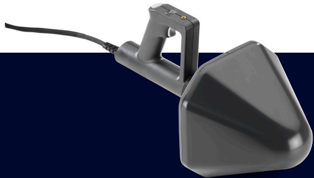
R&S®HE400MW microwave handheld directional antenna with R&S®HE400SCB.