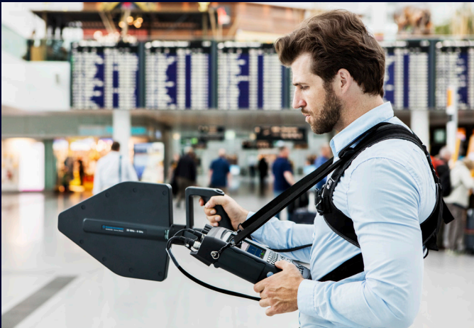
Spectrum monitoring and spectrum surveillance.