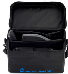
R&S®HE400Z2 transport bag (small).