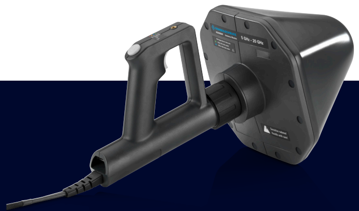
R&S®HE400MW microwave handheld directional antenna with R&S®HE400SHF.