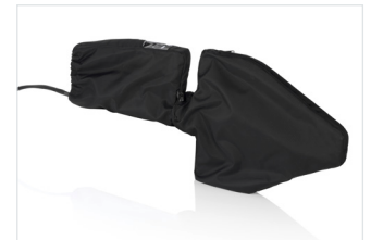
R&S®HE400 and R&S®HE400LP with R&S®HE400-RC and R&S®HE400LPRC rain covers.