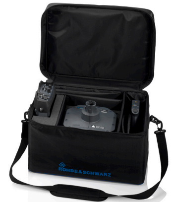
R&S®HE400Z6 transport bag suitable for R&S®HE400SHF/HE400SCB antenna module.