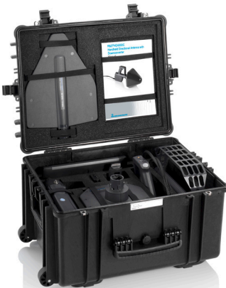
R&S®HE400Z7 transport case – accommodates antenna handle, R&S®HE400VHF/HE400UWB/HE400SHF antenna modules and 15" laptop.