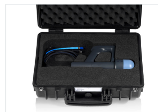
R&S®HE800-PA with R&S®HE800Z1.