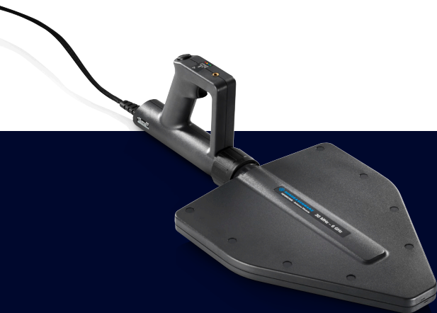
R&S®HE400 handheld directional antenna with R&S®HE400UWB.

The operating frequency range of the system depends on the lower and upper frequency of the antenna, the receiver or the analyzer.