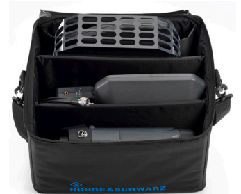
R&S®HE400Z3 transport bag (large).