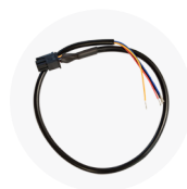
0.35m 4pin Automotive adapter cable