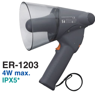
ER-1203 4W max. IPX5*