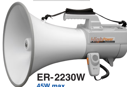
ER-2230W 45W max. with Whistle