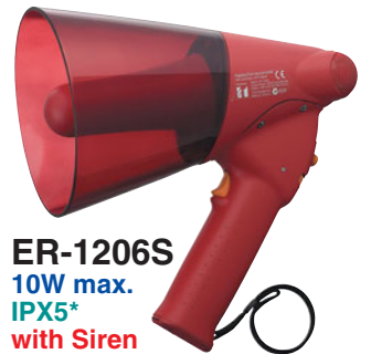
ER-1206S 10W max. IPX5* with Siren

* Protected against heavy seas or water protected in powerful jets shall not enter the enclosure.