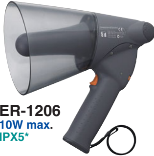
ER-1206 10W max. IPX5*