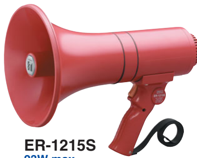
ER-1215S 23W max. with Siren