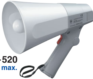
ER-520 10W max.