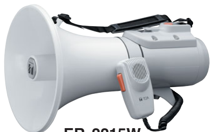
ER-2215W 23W max. with Whistle