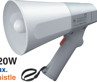
ER-520W 10W max. with Whistle