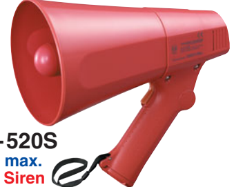
ER-520S 10W max. with Siren