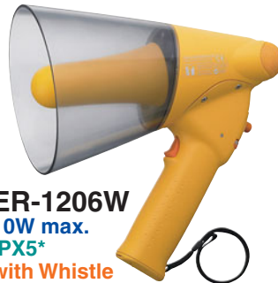
ER-1206W 10W max. IPX5* with Whistle