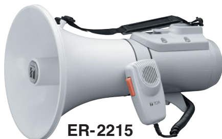
ER-2215 23W max.