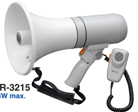
ER-3215 23W max.