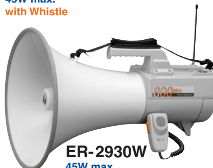
ER-2930W 45W max. with Whistle with Wireless Function