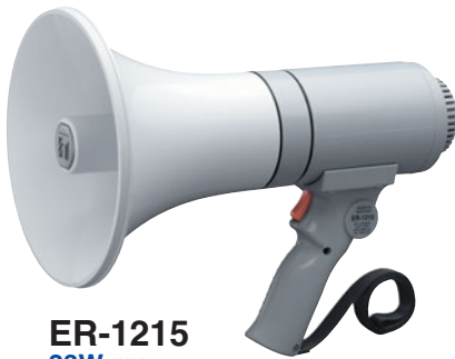
ER-1215 23W max.